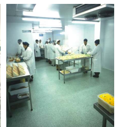
Food Processing & Dairy Industries