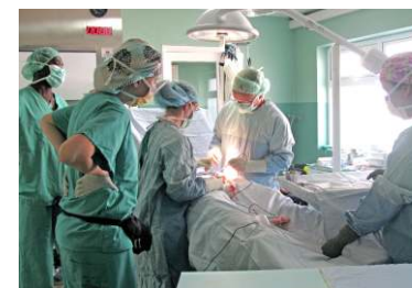
Surgical hand scrubbing for OTs, Clinics & Patients wards